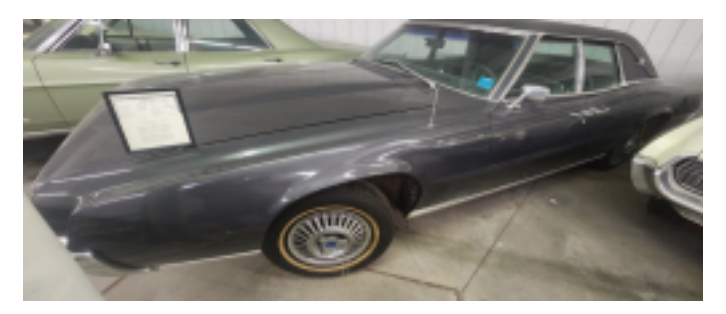
1967 Ford Thunderbird offered the first 4-door option in that line with suicide doors displayed at the museum.

If you have any additional questions or comments about our Adopt-A-Car program, please call the museum office at (308) 832-1181.