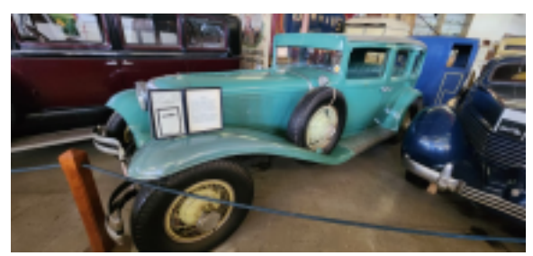
L-29 Cord circa 1931