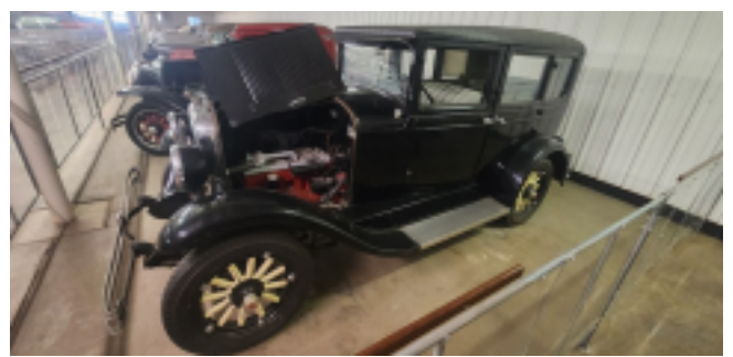
Pontiac 4 Door 6 cylinder, 28 horse power, four door Pontiac on display

Interested in the Adopt-A-Vehicle program at the Pioneer Village Museum?